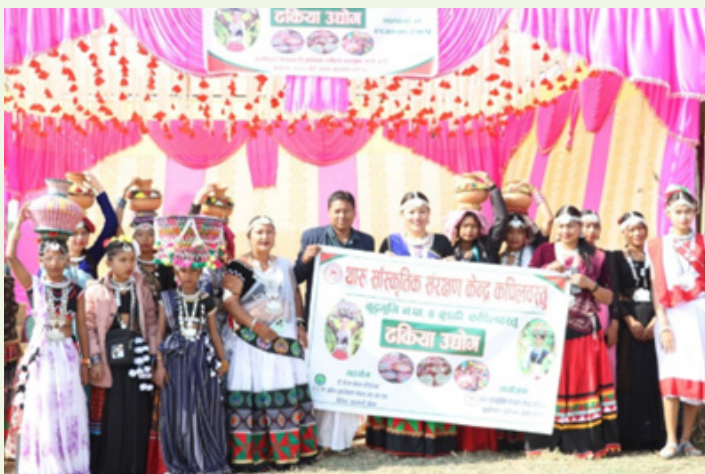
DGM Nepal-Supported Small Grantee Sub-Project's Exhibition of Products by the Tharu Cultural Preservation Center Organized on the occasion of Maghi (Khichadi) Festival 2081, the most significant celebration of the Tharu community. Location: Buddhi, Ward No. 7, Buddhabhumi Municipality, Kapilvastu District, Lumbini Province.